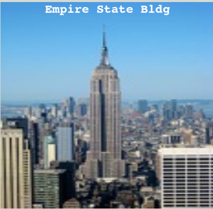
Empire State Bldg

Hotel: Sheraton/Hilton/Doubletree/Radisson/ Hotel Somerset/Crowne Plaza/Courtyard/ Hilton Garden/ Holiday Inn or equivalent.